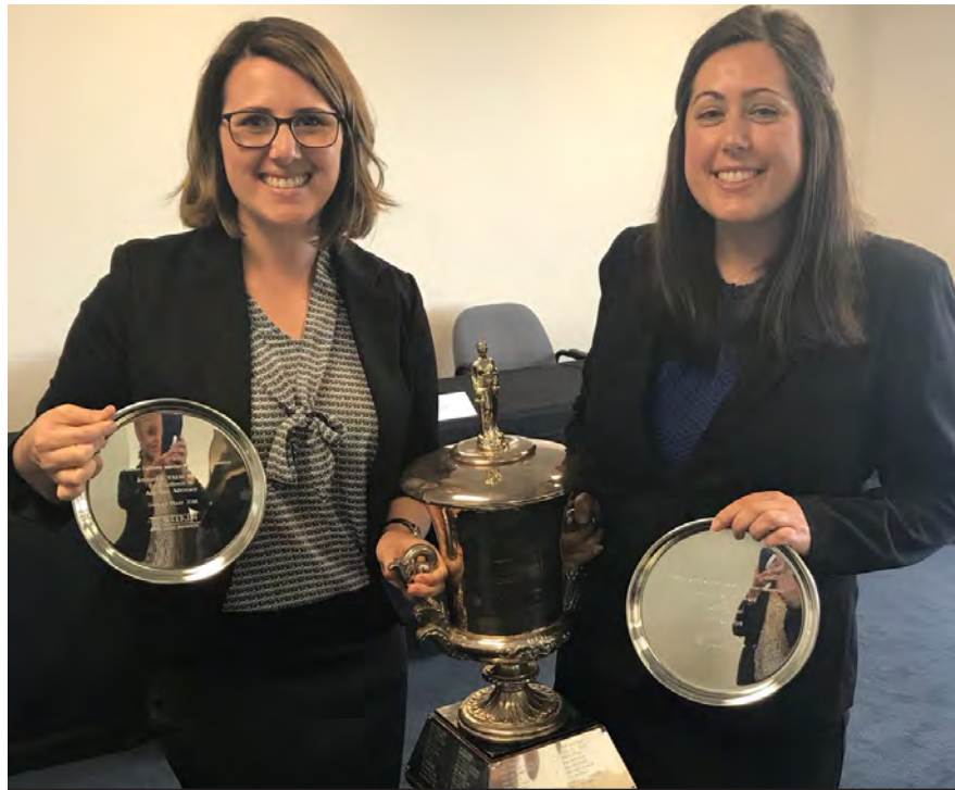
2018 Roger J. Traynor Award 1 st Place for Oral Argument

In April 2000, Empire College School of Law's Moot Court Team captured first place at the 31 st Annual California Moot Court Competition. In 2001, Empire's team captured gold again at the State Bar's Environmental Negotiation Competition. Competing law schools included UCLA, Loyola, Pepperdine, Santa Clara, UC Davis, and UC Berkeley. Empire's teams also placed in the 2002, 2003, 2004, 2006, 2007, 2008, 2009, 2010, 2018, and 2019 California Moot Court Competitions.