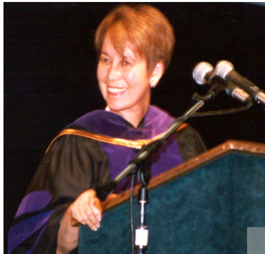
Notable commencement speakers have included (top to bottom): The Honorable Joyce Kennard, Associate Justice of the California Supreme Court; Willie Brown, Mayor of San Francisco; and Patricia Ireland, President of the National Organization for Women.